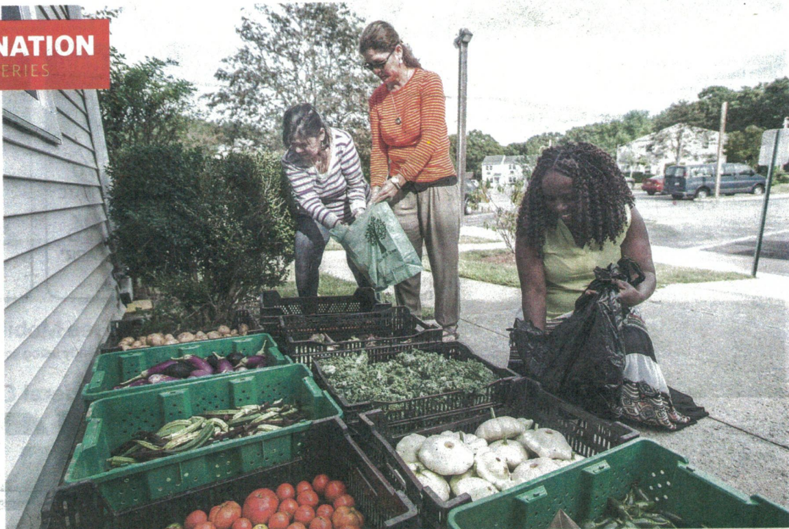
At the Whalebone Village Apartments in East Hampton, tenants stock up from a selection of Food Pantry Farm produce.

He and two friends worked leased plots at the town-